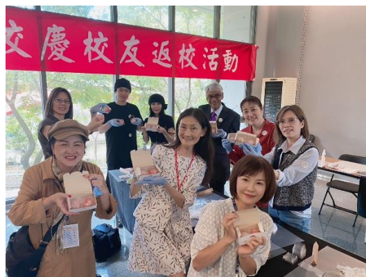
Participated in the 74th Anniversary Celebration of Tamkang University, the Department of Japanese's Homecoming Event.