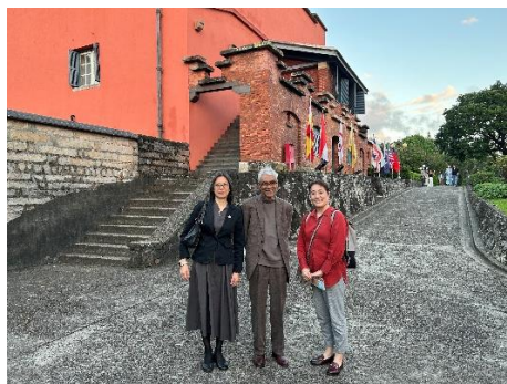
Fort San Domingo in Tamsui